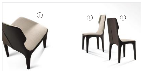
1 Tiche 70301 leather 9122/fanello 7778